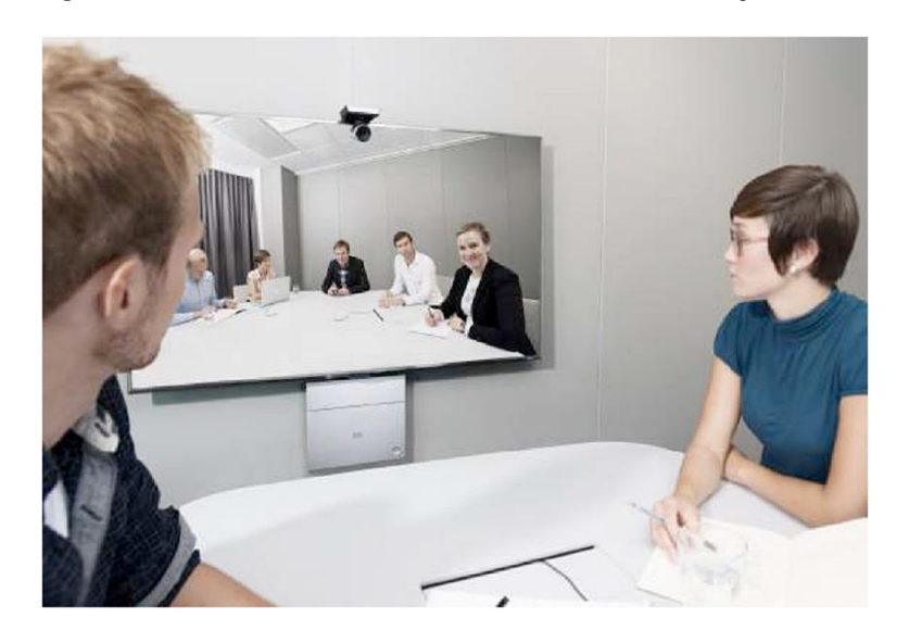
Figure 1. Cisco TelePresence SX20 Quick Set in a Small Meeting Room Environment

SX20 Quick Set combines a powerful codec, Premuim resolution of 1080P, three camera choices, and a dual-display in an easy-to-deploy and easy-to-use solution. Whether you're a small business just getting started with telepresence or a large enterprise looking to expand your existing deployment, the SX20 Quick Set delivers the performance you would expect from more expensive systems - in a compact and feature-rich package. Cisco TelePresence SX20 Quick Set is designed to truly extend the power of in-person to everyone, everywhere.